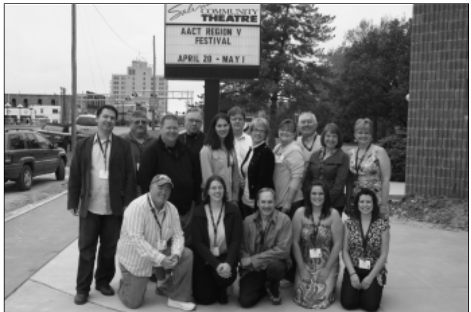
Members for the casts and crews of both Nebraska productions who participated in the Region V Festival outside the Salina Community Theatre on the last day of the festival.

In addition to the 10 productions the Festival featured workshops on a variety of topics including dance, song writing, capital campaigns, arts advocacy, digital sound mixing, and costumes. Salina Community Theatre also was able to show off their nearly completed $3.5 million building expansion project.